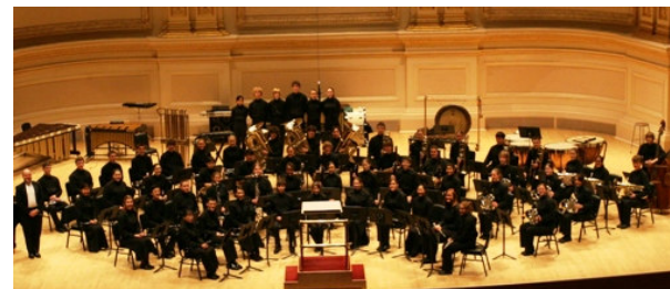
WS Carnegie Hall & invitation to Midwest Clinic!